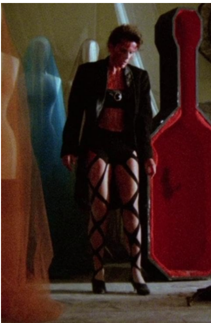
What costume will win the competition?