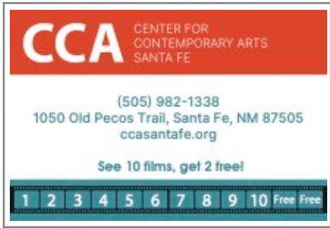
CCA Movie Card - 12 films for $100!!

Card that offers a big discount on CCA ticket prices, and – just in time for the holiday season – new CCA Gift Cards!