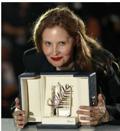
Justine with her top award in Cannes - only the third woman director to receive it.

In 2007, Triet began her career as a documentarian and cinematographer. After making four documentaries in five years, she made the leap into narrative with a short film called Two Ships that was nominated for Best Short Film at both the Berlin Film Festival and the European Film Awards. This success led to The Age of Panic , her first full-length feature that earned a Best First Feature Film nomination at the 2013 Cesar Awards (the French equivalent of the Oscars). She followed with two more highly regarded features that received nominations for major film awards – In Bed with Victoria and Sibyl . To cap her 16-year cinema career, Justine Triet triumphed this year at Cannes by receiving the Palme D'Or for Anatomy of a Fall .