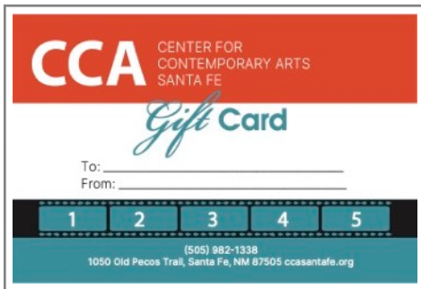
CCA Gift Card - 5 movies for $50!!

You really can't beat this kind of discount!