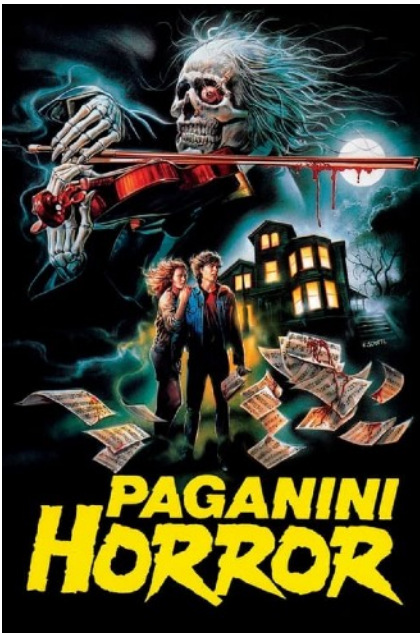
Halloween rock movie Oct 31 at 6pm + costume contest with prizes!