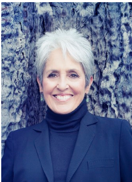
See the Joan Baez documentary at CCA through November 2

The answer is "Yes!" Joan Baez I Am A Noise returns on Wednesday, October 25 and plays for seven more days (until November 2 ). It will screen on Wednesday and Thursday in the big Cinema, and then switch to the smaller CCA Studio on Friday, October 27 so we can make room for Anatomy of a Fall .