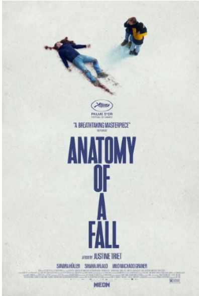
The top film at Cannes opens Friday, October 27