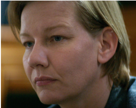
Sandra wonders how it all came to this in Anatomy of a Fall

I really thought about and wrote the film for Sandra, and it would not have worked if she had not accepted the role. I wanted the character to be a foreigner, and I wanted to play with the use of language at the trial and also in the spectator's mind. I wanted her to be judged like a foreigner, with a language issue – writing in English, being German, but living in France with her partner.