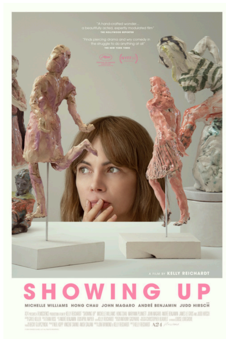
Showing at CCA May 11 - 18

Reichardt made her first film River of Grass in 1994. It did quite well for a debut feature. But she had to wait 12 years to get her next film made - Old Joy . That film made a critical splash and created a devoted fan base for her work. Her determination to continue making films has produced six more memorable features in the last 11 years.