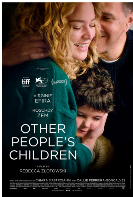
Showing at CCA May 11 - 18

This is our RE-opening weekend. We wouldn’t be RE-opening without all your support and donations! Thanks so very much again. But please continue your support by coming this week. Your continued patronage will help the CCA Cinemas survive.