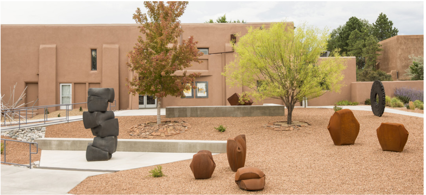
CCA Campus